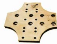
90 DEGREE ROTATE PLATE